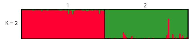
Fig. 1. Genetic structure of red fox populations in Slovenia (1) and B&H (2), determined by STRUCTURE.

STRUCTURE estimates ancestry proportions and admixture based on genotypes, relying on assumptions like linkage equilibrium and HWE. DAPC employs dimensionality reduction and discriminant analysis for membership assign-