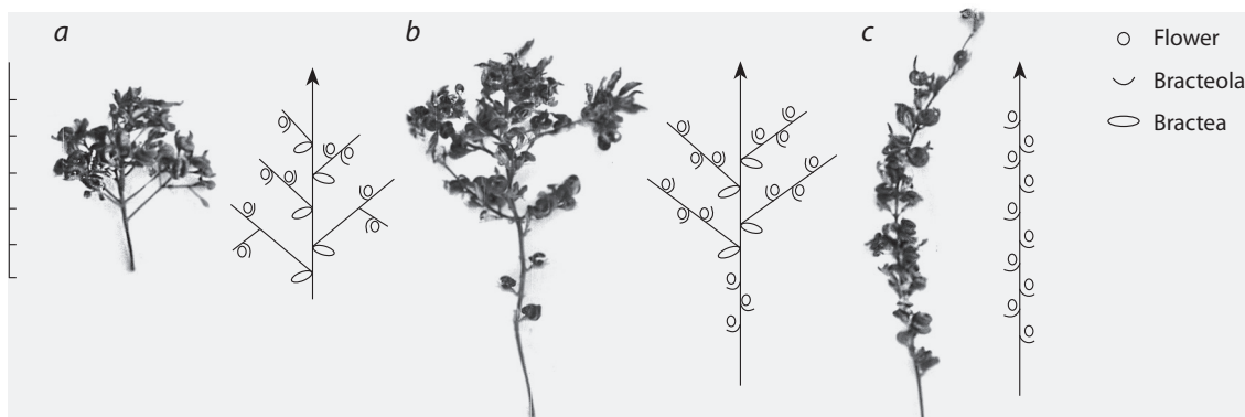
Fig. 1. Picture and scheme of main mutant inflorescences in alfalfa.

a – panicle ( pi-1 ); b – branched ( bri ); c – long petiole ( lp ).