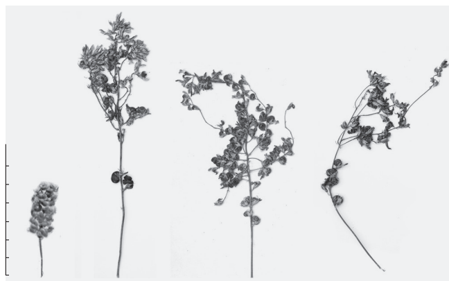
Fig. 3. Wild type (left) and branched inflorescences.

a – normal inflorescence of alfalfa – a raceme; b – fertile panicle with pods ( pi-1 ); c – sterile panicle (cauliflower type inflorescence).