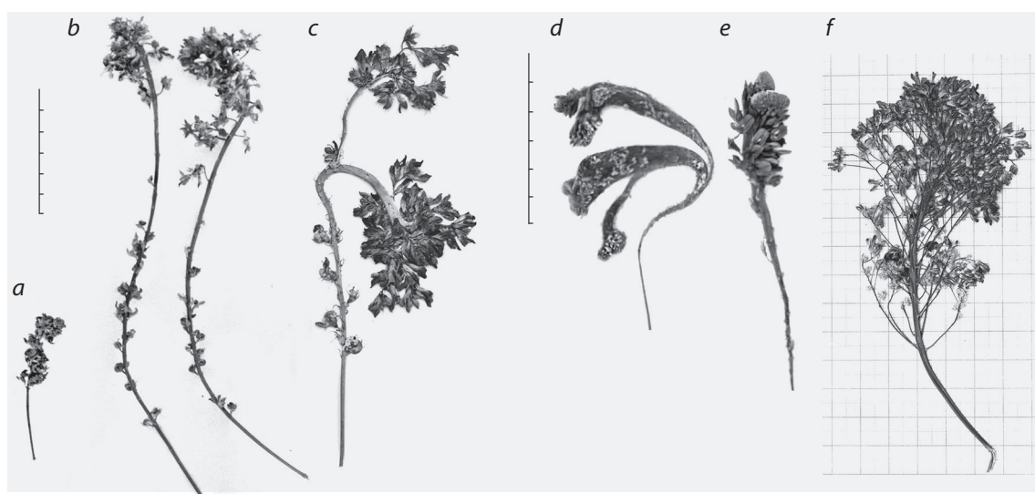
Fig. 5. Fasciated long petiole lpfas inflorescences and inflorescence of hybrid plants from hand crosses between different mutant types with fasciated long inflorescence.

a – malasian alfalfa S1 plants from VIR collection selections; b – spontaneous mutants.