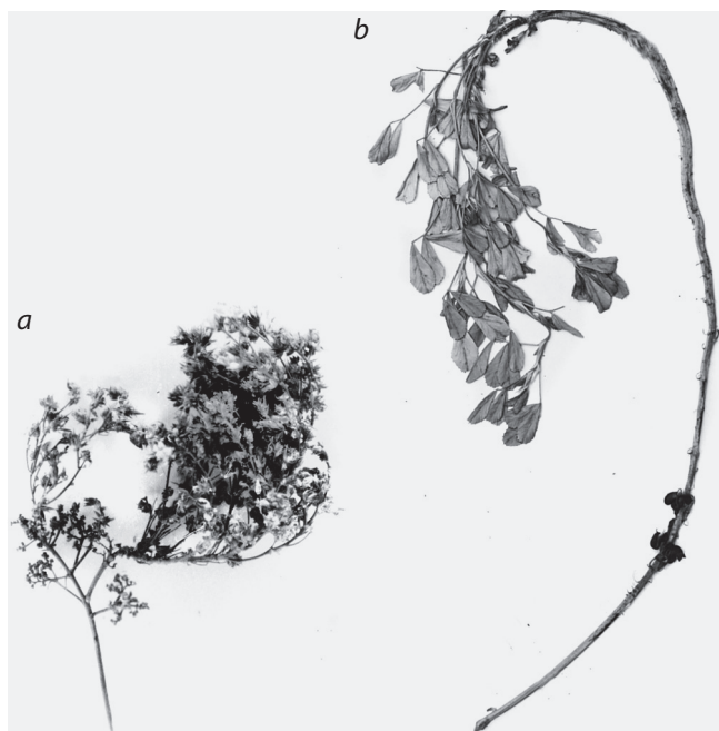
Fig. 6. Proliferation. a – in cauliflower inflorescence; b – in long inflorescence.

some flowers had polymeric gynoeceum, nevertheless most of the plants set the pods. In pea (Sinjushin, 2016) fasciation of the peduncle did not affect the viability of flowers in most cases, too. As a rule, fasciation affects most of SAM and FAM of the plant simultaneously, leading to the peduncles and stem flattening to the different extent. New combinations of mutant inflorescence types with fasciation and their designation are given in the Table 1.